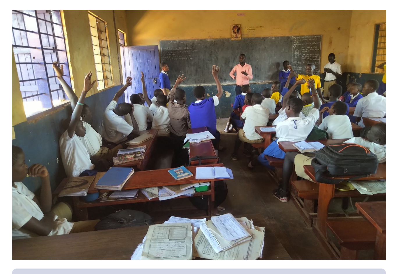
Figure 1. Problem identification Photo