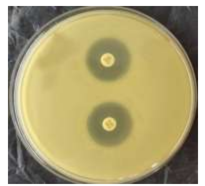
Fig. 1-a: ESBL Negative

Student's Journal of Health Research Africa e-ISSN: 2709-9997, p-ISSN: 3006-1059 Vol. 5 No. 6 (2024): June 2024 Issue https://doi.org/10.51168/sjhrafrica.v5i6.716 Original Article