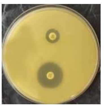
Fig. 1-b: ESBL Positive

During the study, a total of 2,452 numbers of organisms were isolated from different clinical samples among them, 1571 i.e. 64% of isolates were found to be ESBL producers.